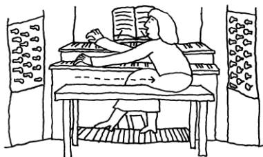
AN UNSECURED ORGANIST