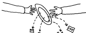
SLIPPERY COLLECTION PLATES